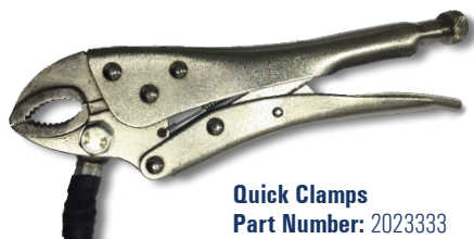
Quick Clamps Part Number: 2023333

WELDING STUDS | FASTENERS | COLD HEADED PARTS